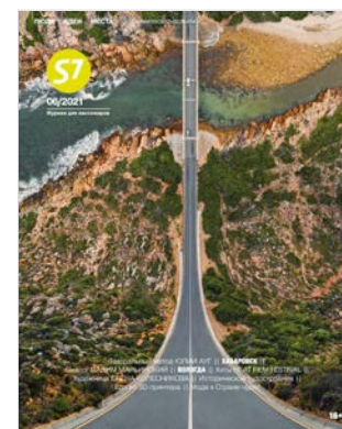
For JSC "Aeroflot-Russian Airlines" (Sheremetyevo Airport, Moscow, Emelianovo Airport, Krasnoyarsk)